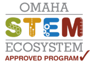
Omaha STEM Ecosystem Certified