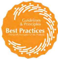
Nonprofit Association of the Midland's Best Practices Partnership