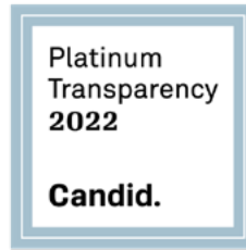
Candid's Highest "Platinum" Rating for Transparency