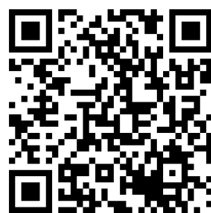
Enhance KOB Programs by Donating