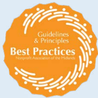
Nonprofit Association of the Midland's Best Practices Partnership