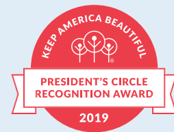
Keep America Beautiful's President's Circle Recognition