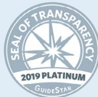
GuideStar's Highest Platinum Rating for Transparency