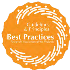
Nonprofit Association of the Midlands' Best Practices Partnership