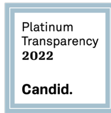
Candid's Highest "Platinum" Rating for Transparency